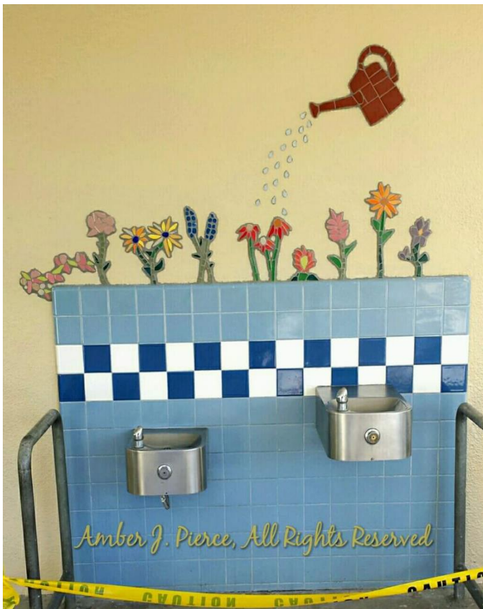
Wildflowers & Water