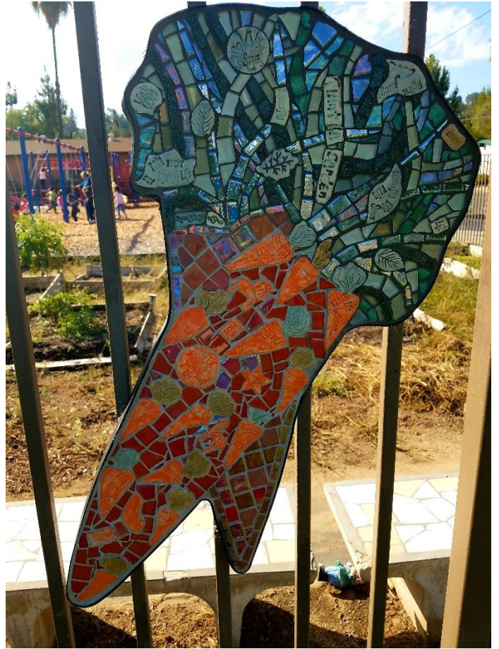
Second set of veggies: Handmade tile, glass, vintage tile, and sculptural glass on hand-welded steel forms, welded to fence.