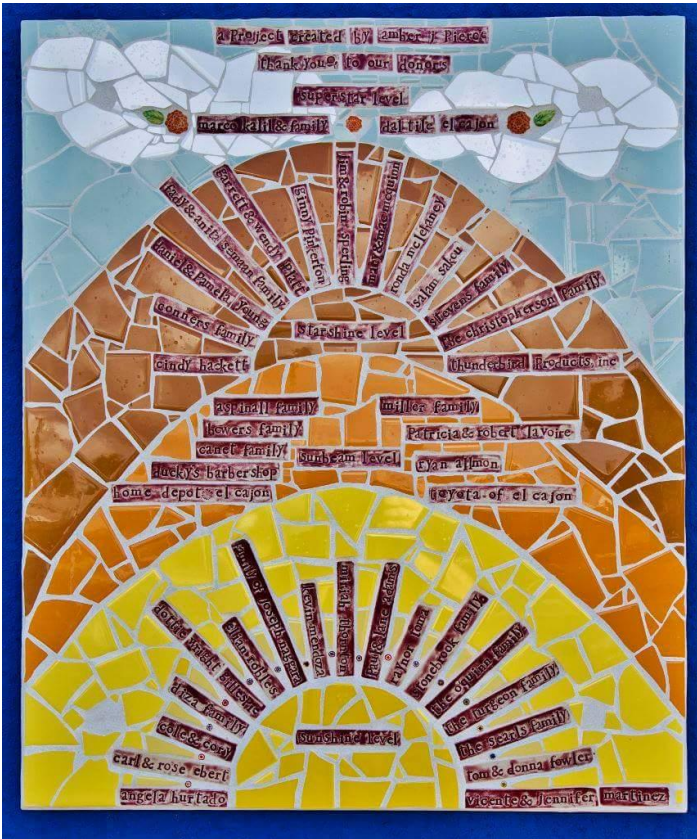
Donor Panel: Levels of giving