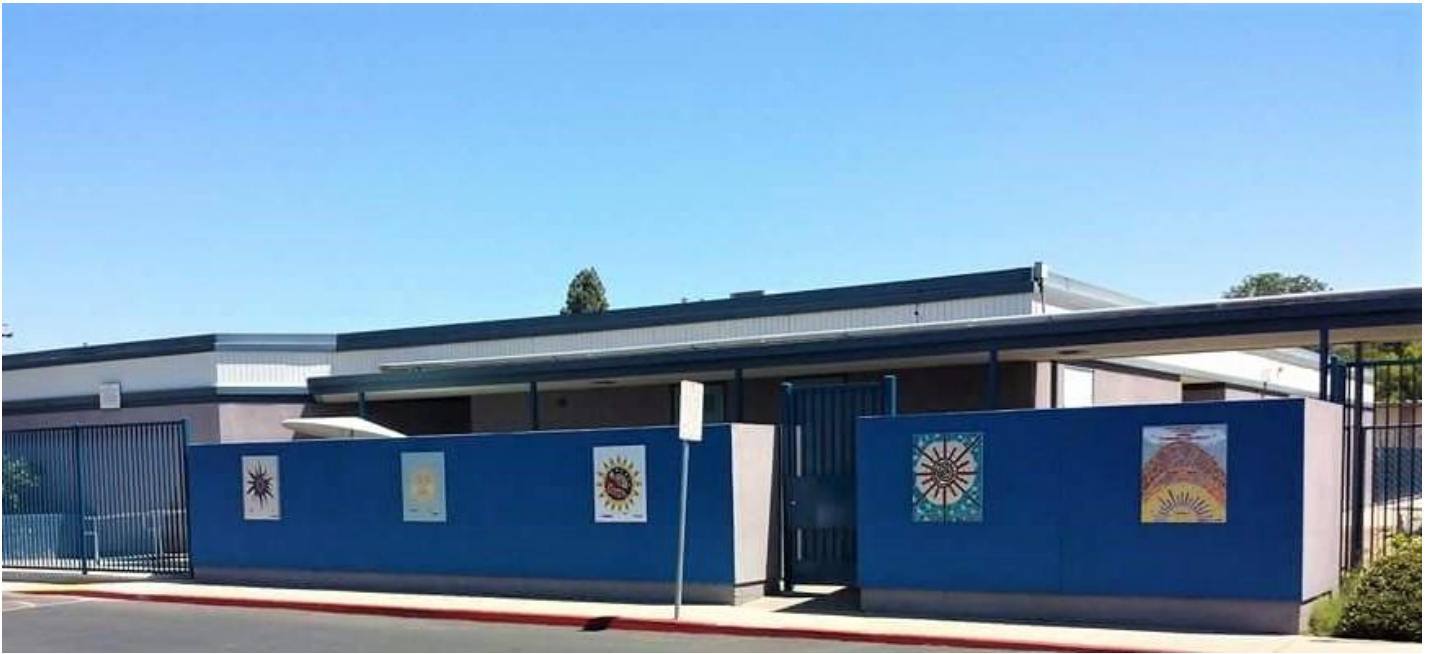
Asian Sun: Balance

Fresh color and first 5 panels installed