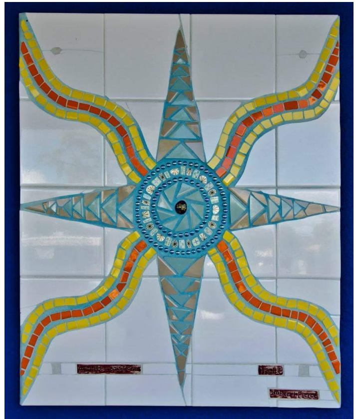
Middle Eastern Sun: Light