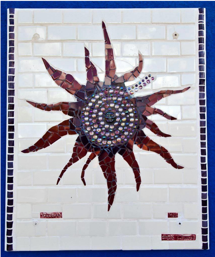
African Sun: Life