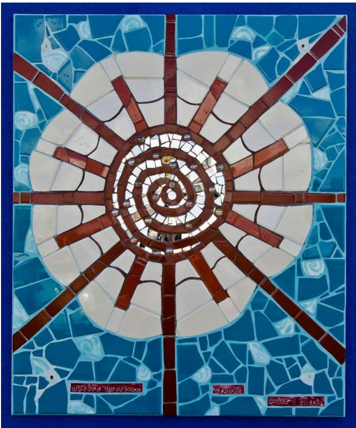
Native American Sun: Growth